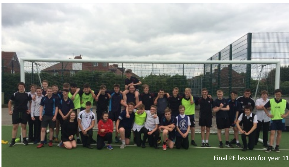
Final PE lesson for year 11