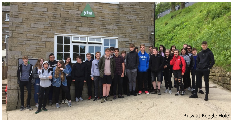
Busy at Boggle Hole