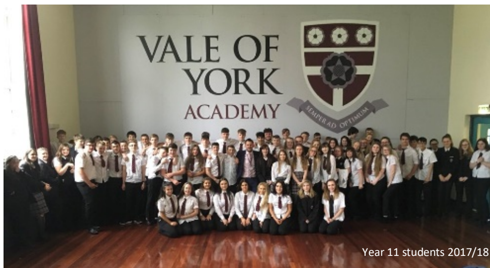
Year 11 students 2017/18